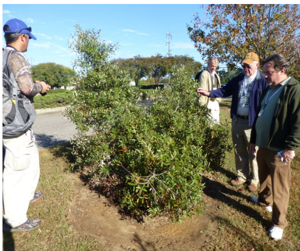
Looking over a Quercus pumila Walter.

A full account of all the tours will be found in the upcoming issue of International Oaks and those not present will get a better feeling for just how incredible the City of Aiken and its