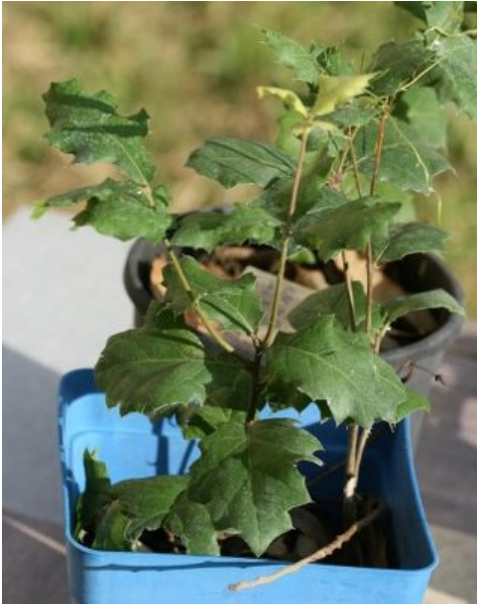
Quercus agrifolia seedling. netic background most interesting in its implications.

The first scenario that comes to mind is one where all of the four species share the same chromosome type and the same type of pollen grain. The ability of the Israeli species to pollinate and fertilize the Californian species – and to a lesser degree the cork oak – while holm oak remains sterile and isolated, might indicate their very ancient origin from times before the breakup of the ancient single continent, when their distribution comprised all the Northern Hemisphere. Other mating patterns could be described, but all would need critical experimental verification.