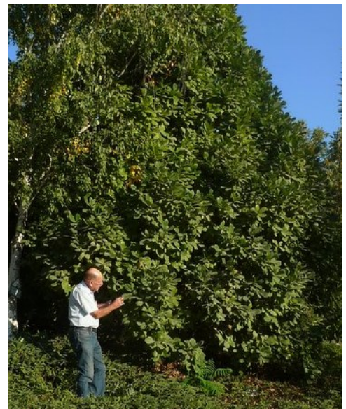
Author with Quercus pontica .

b) Contrarily, the Q. pontica in the Botanical Garden grows in the immediate close proximity of a significant number of mature trees from different deciduous European species – but is absolutely barren of any ripe acorns! Though it usually flowers, any pollinated female flowers are aborted and shed in the course of the summer.