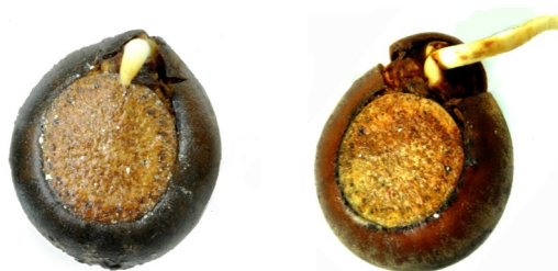
Radicle emergence from cup scar.

duce another young shoot and may do so several times, but without enough