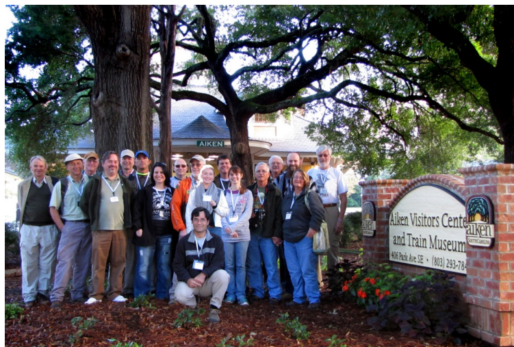
Aiken OOD attendees.

One of the mile-long oak collections was planted along a median parallel with the train tracks that run through the heart of Aiken. We stopped at the Aiken County Agricultural Services Center where several rare species of trees and shrubs have been planted over the years. A subspecies of sugar maple ( Acer saccharum sbsp. leucoderme Small) was beginning its showy fall color display and a putative hybrid of Quercus rysophylla Weath. × canbyi Trel. planted by Bob were among the first trees encountered here. A beautiful Q. salicina Blume with limbs practically lying on the ground met us as we rounded the corner of the building. Just beyond this were two Lithocarpus species ( L. edulis (Makino) Nakai and L. glaber