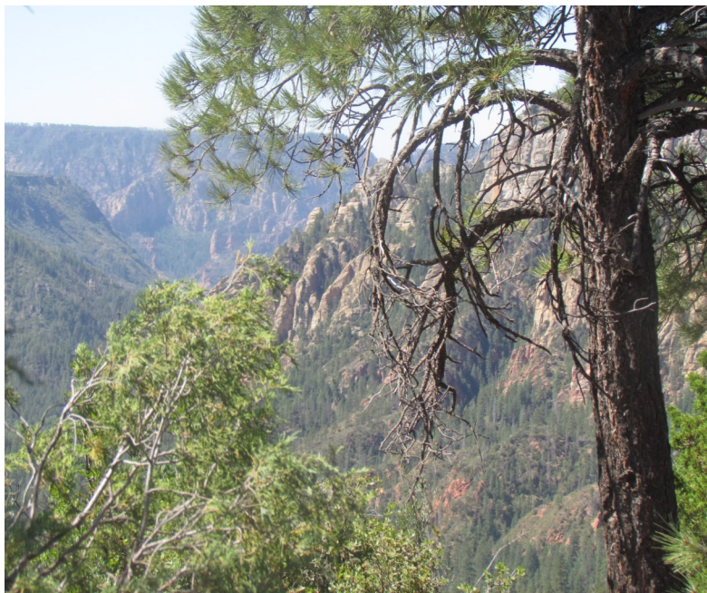
View of Oak Creek Canyon from a lookout point.

The mouth of Oak Creek Canyon starts near the red rocks of Sedona, and the canyon extends northward, narrowing as it goes. It cuts through the different strata of the Colorado Plateau, revealing first the beautiful red sandstones of the Sedona area at the mouth and then white sandstones farther north in the canyon. The rim of the canyon is made of black basalt. The stream that cuts down through the canyon is scattered with large boulders of these various rock types, which have been washed downstream in the periodic flash floods that occur during the monsoon and heavy winter rains. Oak Creek originates from a number of tributary springs that come down from the headwaters of the many side canyons that join Oak Creek, including West Fork canyon. Oak Creek Canyon drains the Colorado Plateau from north to south, while the side canyons enter from the east and west. The tributary springs well up at the transition between the white sandstone strata and the more impermeable basalt layer.