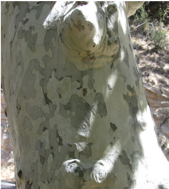
Arizona sycamore bark detail.

Oak Creek Canyon suffered a couple of severe wildfires in 2006. The fires burnt the chaparral and ponderosa pines on the west side of the canyon. Though the fire benefited the chaparral habitat, traces of those fires can be seen today in the dead ponderosa and