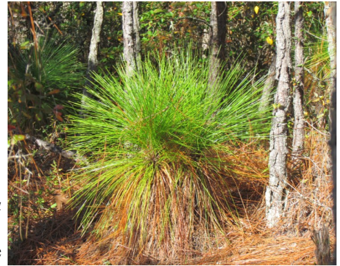
Young longleaf pine.