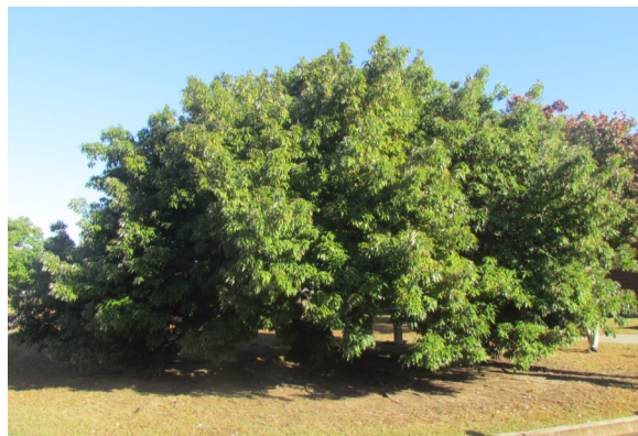
Quercus salicina Blume.

The second day of tours took us to Colleton Avenue, another mile-long collection of rare trees and shrubs which is located in a residential area of Aiken. Wide medians allow for excellent planting areas and this has wisely been taken advantage of. One unique aspect of this collection is the signage that the city installed with Bob's guidance. Designated trees are labeled with genus, species, and common name along with a phone number and an extension code. Visitors can dial (803) 295-5008 and the extension of the tree they wish and a short message about each tree follows. There are over 100 trees and shrubs labeled this way, allowing for self-guided tours through the collection. We concluded our journey at Hope-