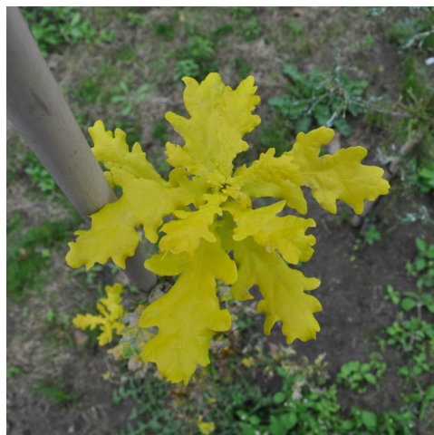
Young Quercus robur ‘Concordia’ graft.

Despite the fact that acorns germinate readily, successful seedling establishment is very difficult. We have never found any young seedlings in the field. Conditions of high humidity are essential for germinated seeds to grow into seedlings. In drier air, the emerged young shoot will dry out. Sometimes, the seed will keep struggling to pro-