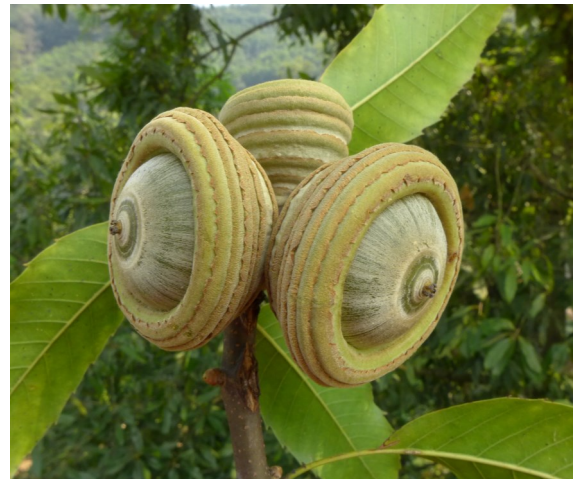
Quercus austrocochinchinensis acorns.

Quercus austrocochinchinensis Hickel & A. Camus is a Critically Endangered species. It has a scattered distribution in ravines of Hainan and southwest Yunnan provinces of China and northern Indo-China and is one of the dominant tree species in these regions. Based on herbarium records, it was once the dominant tree of the seasonal tropical forest of these regions, but due to the development of the economy and agriculture, its habitats have been taken over by rubber tree and banana farms. As a result of this, the populations of Q. austrocochinchinensis have decreased dra-