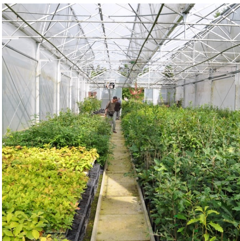
View inside Pavia's greenhouse.

Before lunch, we visited another greenhouse with a wonderful display of a diverse assortment of oaks, all grafted. Several selections illustrated