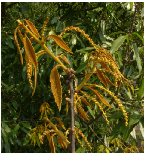
New flush of growth showing orange-colored tomentum.

There are simple horticultural reasons for grafting oaks, such as selections for: