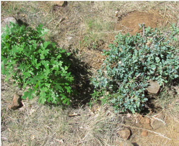
Meeting of two species: Quercus gambelii and Q. turbinella .

forms extensive stands in Central Arizona. Turbinella oak is often a shrub (5 x 5 ft/1.5 x 1.5 m), but can be a small tree up to 15 ft/4.6 m tall. It has small thick leathery leaves with an extensive underground root system to gather moisture. Bearberry ( Arctostaphylos pungens Kunth), a large shrub with bright red bark and small, pointy, glossy leaves, dominates higher-elevation south slopes and forms pure stands in the Oak Creek area. Rhus ovata S. Watson, known locally as Sugarberry, is a shrub with large oblong leaves found in lower elevation chaparral. Q. palmeri Engelm. is a large shrub oak that is abundant in the Oak Creek area. Palmer oak often hybridizes with Q. chrysolepis Liebm. in middle elevations of the canyon. Madrean oak woodlands are at their northern limit on the Mogollon Rim and are mostly composed of several evergreen oak species, specifically Q. emoryi Torr., Q. grisea Liebm., and Q. arizonica Sarg. Q. grisea is often found mixed with junipers, and turbinella oak grows on dry south slopes. Q. grisea is often a small tree or shrub and hybridizes with turbinella oak. Q. arizonica is a large tree that grows on north slopes and in riparian areas. It often hybridizes with Q. grisea , forming hy-