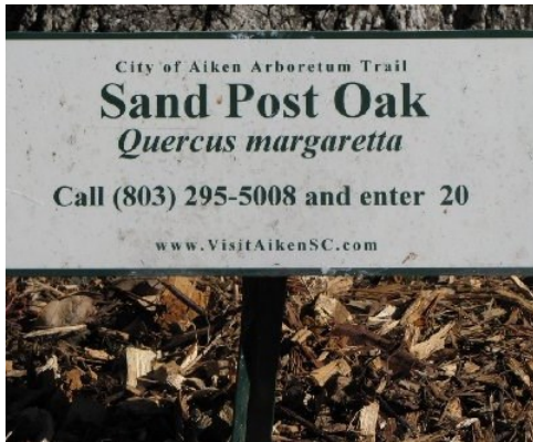
Colleton Avenue Tree Trail plaque.