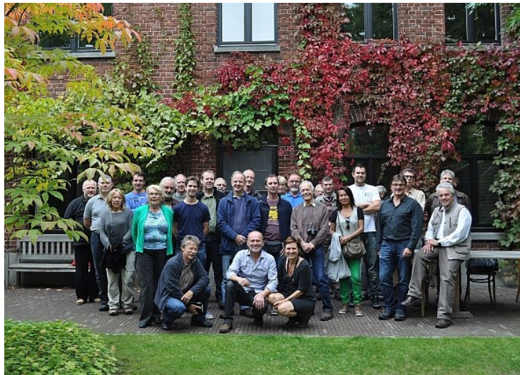
Pavia OOD attendees.

I met Dirk for the first time during a trip in the Fall of 1997 in New England. I had never visited his nursery in Belgium until this 22 nd of September,