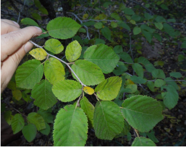
Knowlton hophornbeam.

in reproducing, but scattered trees are found in the area.