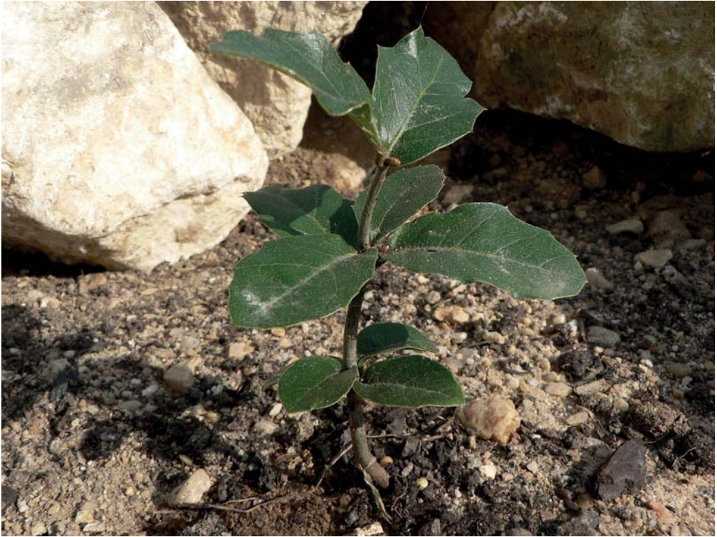
1/ Quercus hintoniorum Nixon & C.H. Mull.

have gotten from one. There are many more studies from all regions of the globe showing the same decline in the density of vitamins and minerals found in our food, including the food produced on organic farms.