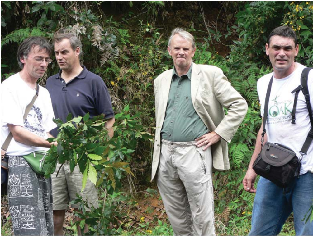
Some of the world's top oak experts from France, Belgium, Mexico, and Spain try to identify oaks.