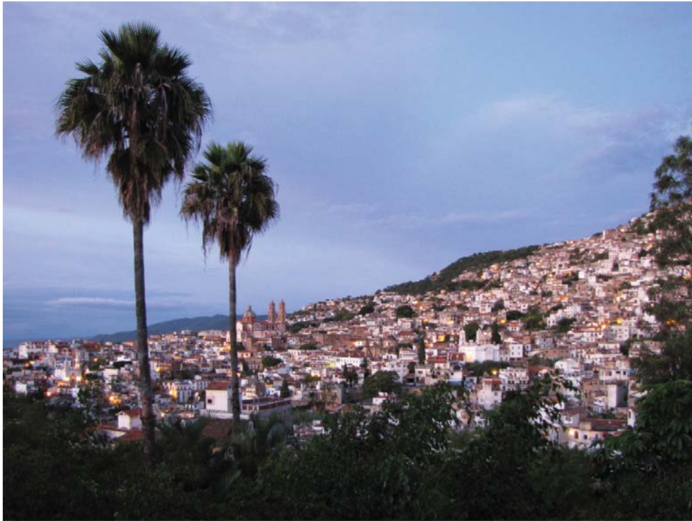
The historic city of Taxco, seen from our Hotel La Borda at dusk.