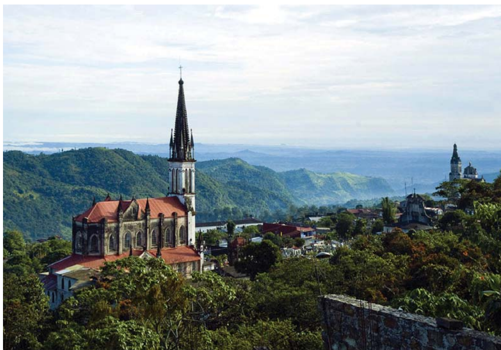
The spectacular setting of Cuetzalan.