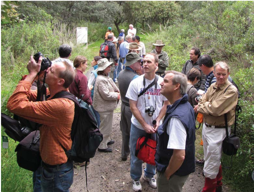
Participants from a dozen countries experience the vegetation of Ecoguardas Park near Mexico City.