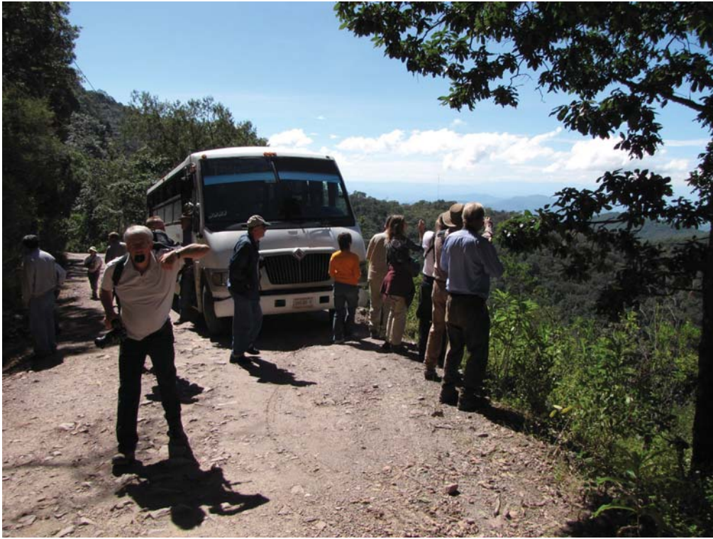
Photo Stop in Guerrero.