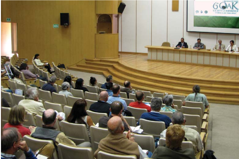
Opening ceremonies at the Benemérita University, Puebla Faculty Auditorium.