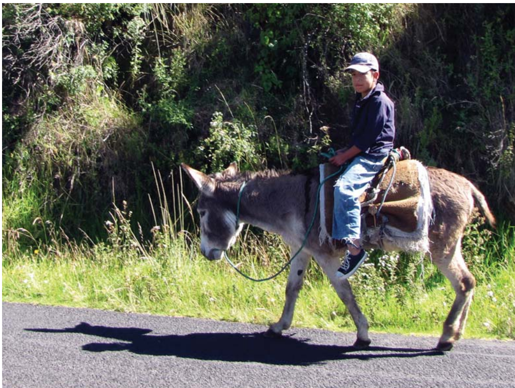
A local boy observing the International Oak Society.