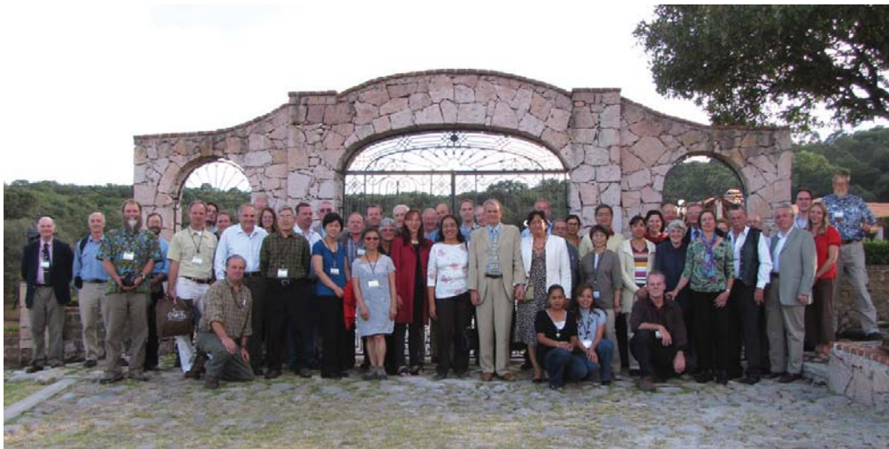
2009 Conference attendees at Haras del Bosque for the final banquet.