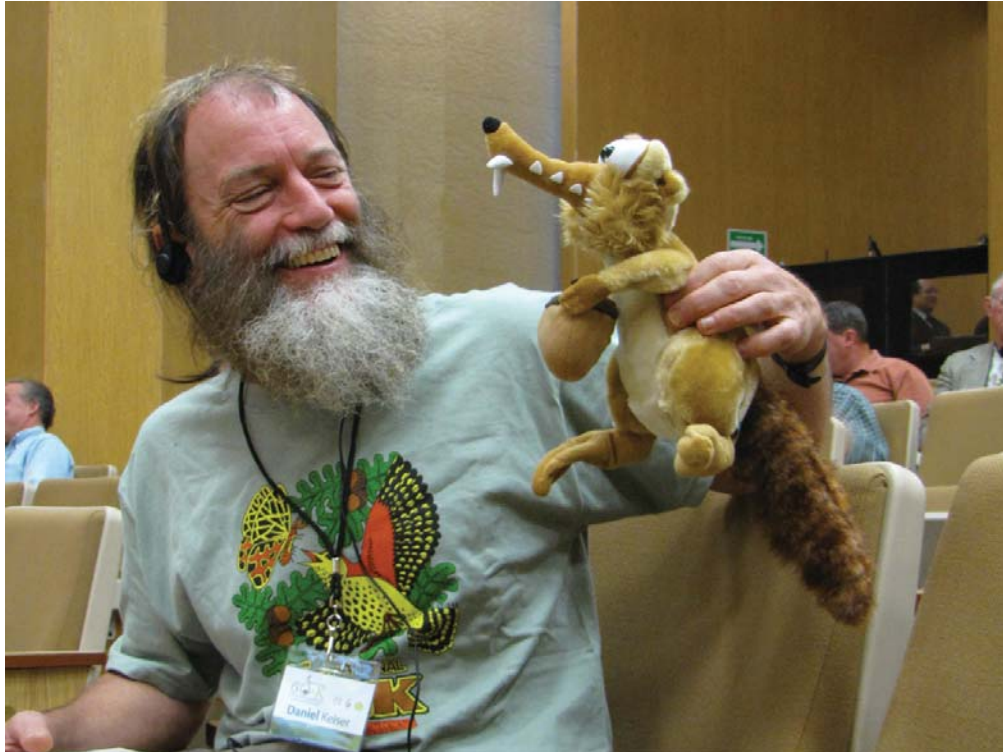
May I have your acorn?