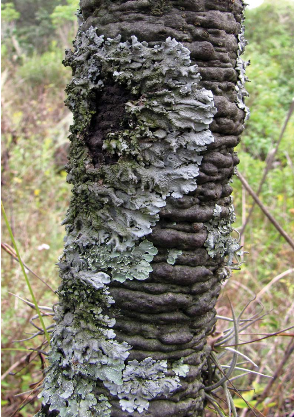
The typical "bubble bark" of a lichen-encrusted young Quercus castanea .