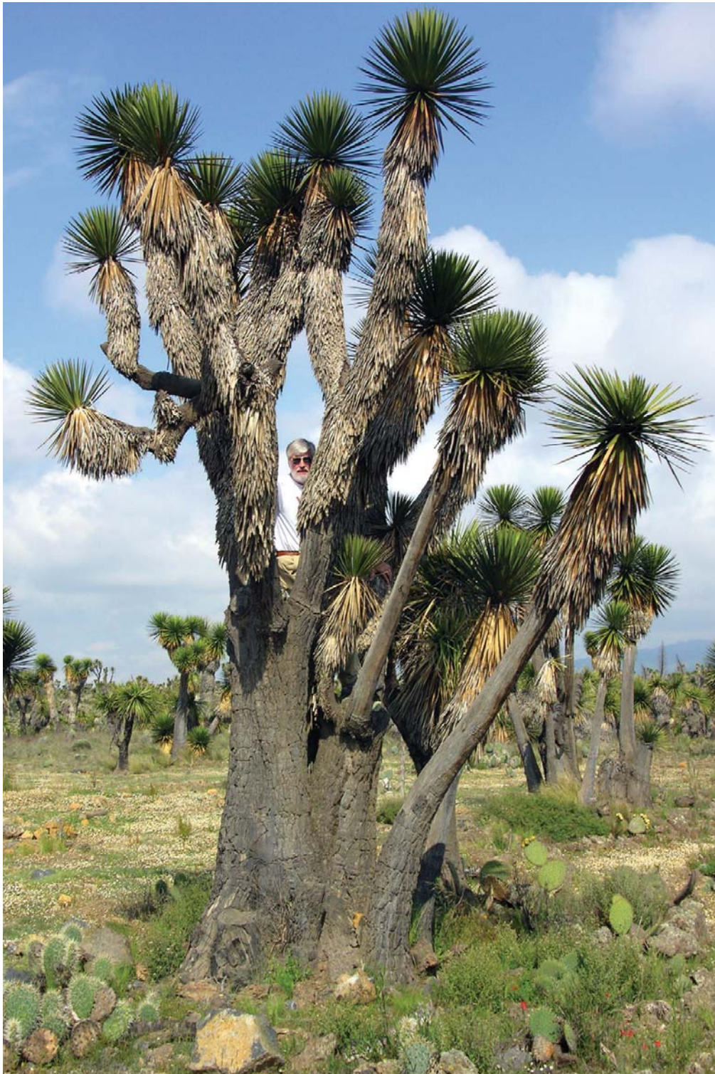
Guy Sternberg in a large Yucca periculosa near Perote Volcano.