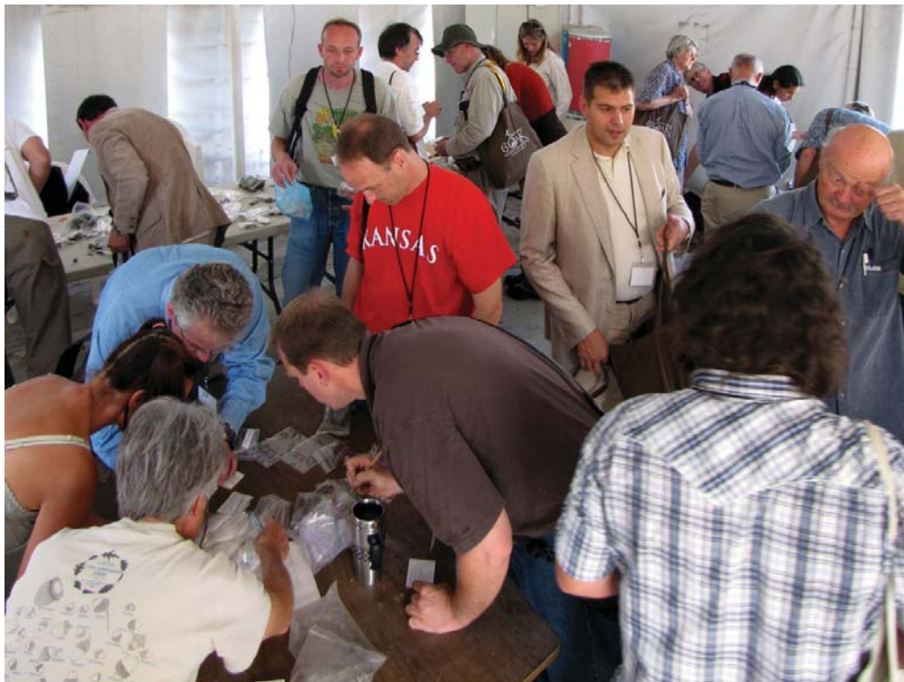
Seed Exchange in a tent on the grounds of the Benemérita University of Puebla Botanic Garden.