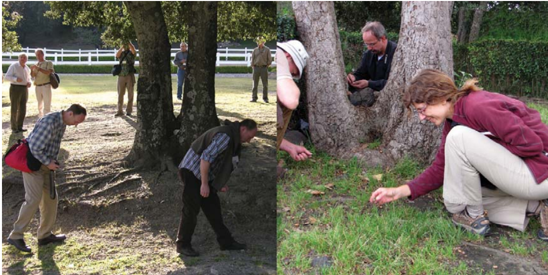
The acorn walk.