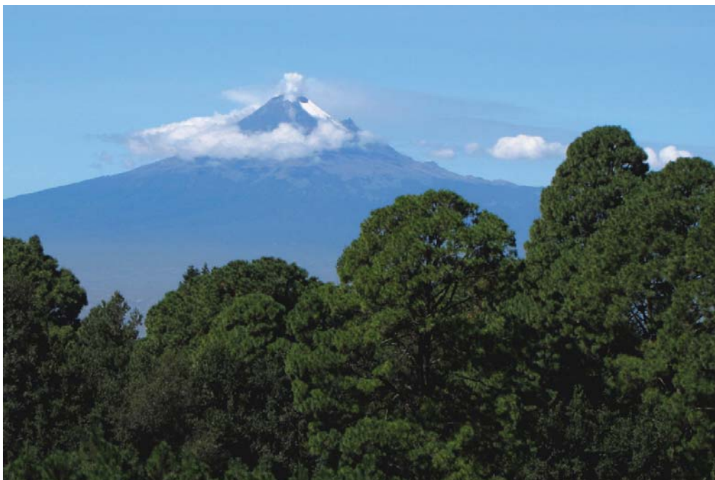
The great volcano Popocatepetl rises over pines and oaks with its constant plume of smoke.