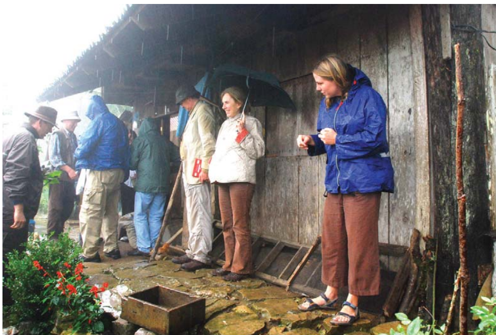
The rain pours down through leaves of Quercus corrugata in Cuetzalan.