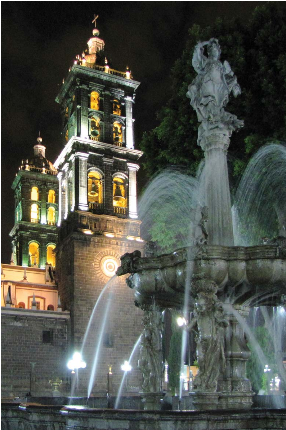
Night view of the cathedral near the hotels in Puebla.