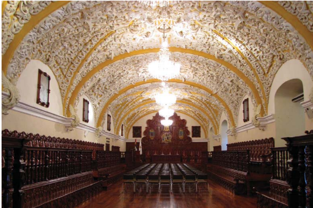
The magnificent Salon Barroco in Puebla, where we held our opening reception.