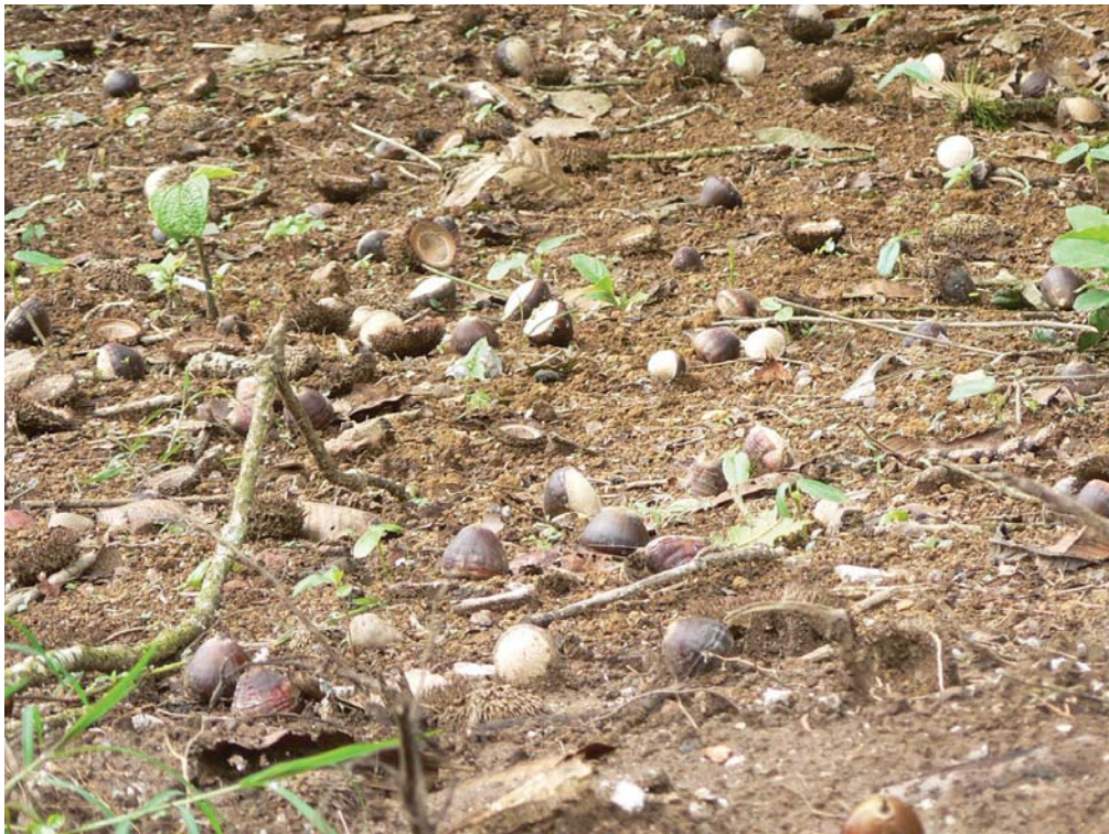
A field of Quercus insignis acorns.