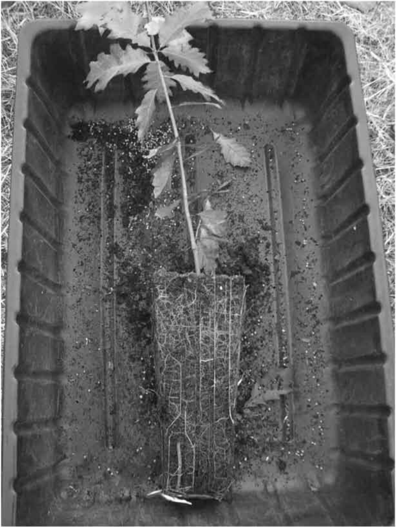
Figure 4. Quercus rubra L. (northern red oak) rooted juvenile stem cuttings after 12 weeks under intermittent mist in a rooting chamber.