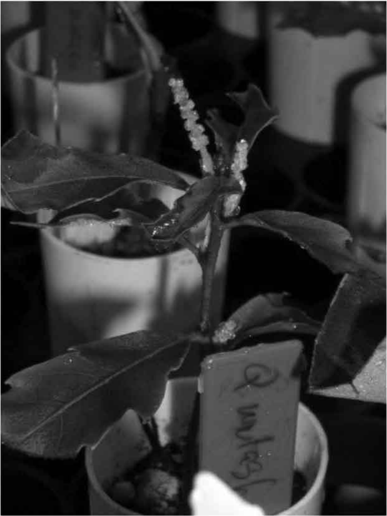
Figure 3. A rooted stem cutting of Quercus wutaishanica Mayr. (Liaodong oak) in flower.