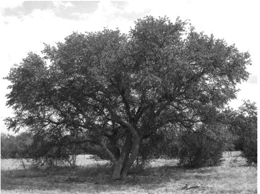
Q. fusiformis – New Mexico