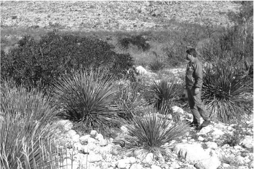
Q. pungens and author