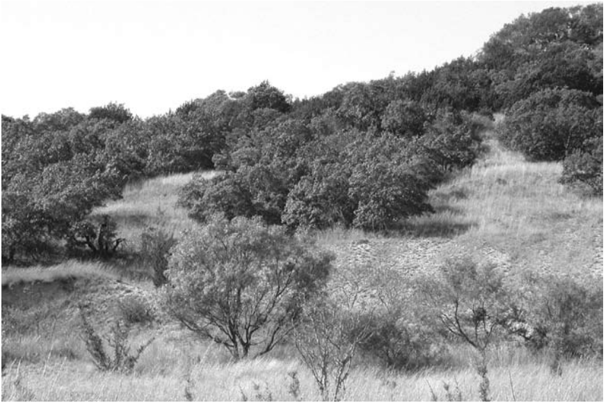
Q. buckleyi habitat