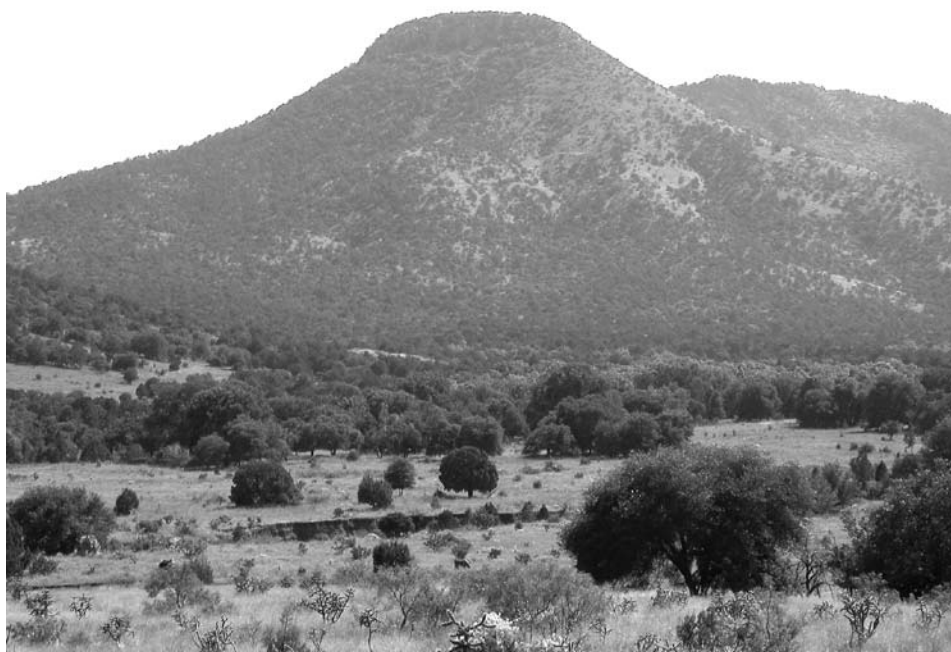
Mexican Oak Woodland

This presentation featured a photo essay of the desert edge areas of the Chihuahuan Desert Region of New Mexico and Trans-Pecos Texas, showing the transition from pure desert grasslands or desert scrub land into the woodland zone where most of the species of oak native to this region can be found. Images showing tree habits and surrounding soil and vegetation were included in the original presentation. The program was designed to give the audience an appreciation of the uniqueness of the genus Quercus in this area, and its ability to grow under the strenuous, arid, poor soil conditions. The program is reproduced in considerably abbreviated form, here in International Oaks .