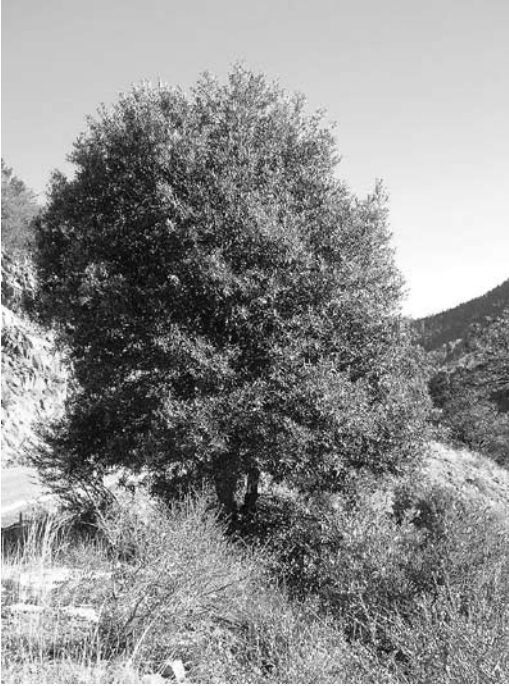
Q. hypoleucoides near Emory Pass