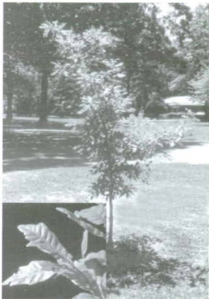
Fig. 2. A young bluff oak ( Quercus austrina ) planted by Bob McCartney along a boulevard in Aiken, SC.

Building on the extensive variety of oaks already in Aiken, Woodlanders Inc., an international source for rare and hard-to-find plants, has, over the past two decades, added steadily to the