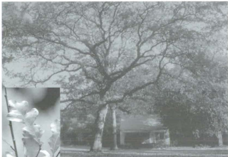
Fig. 1. A majestic old sand post oak ( Quercus margaretta ) preserved along a street in Aiken, SC.

Aiken, a town of about 26,000 is located in the Fall Line Sandhills of South Carolina about 15 miles from Augusta, Georgia. The Fall Line Sandhills are an ancient coastline with high rolling hills of deep, sandy soil. Lying between the relatively flat Coastal Plain and the rolling dry hills of the Piedmont Plateau, the Sandhills once supported an extensive forest of longleaf pine ( Pinus palustris ) maintained by relatively frequent ground fires. Originally ignited by lightning and later also by humans, these low-intensity fires burned unimpeded over vast areas and maintained a uniquely adapted ecosystem. With land-use changes and fire suppression, this ecosystem has almost disappeared. Many fire-adapted species that characterized this ecosystem have become quite rare.