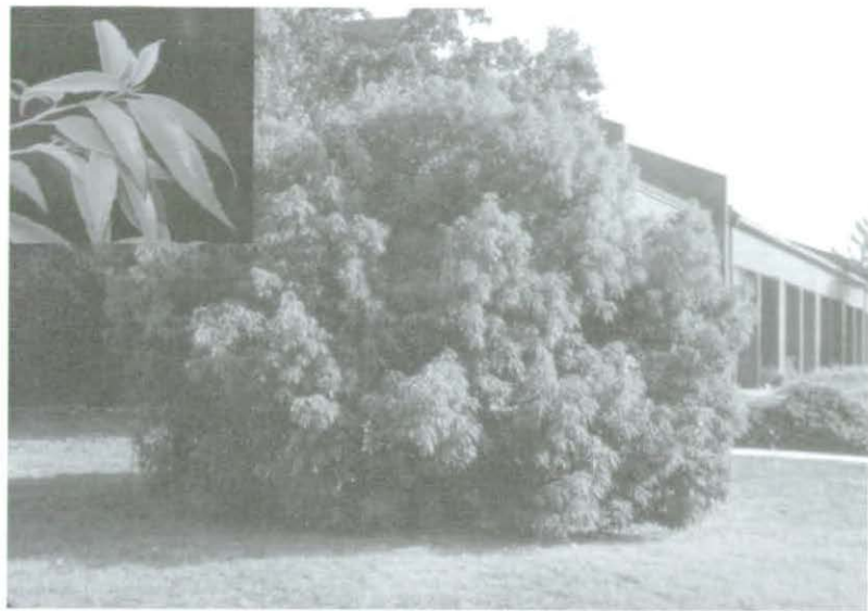
Fig. 5. An Asian ring-cupped oak ( Quercus salicina ) originating from plants brought from Nagasaki, Japan, planted by Bob McCartney in Aiken, SC.