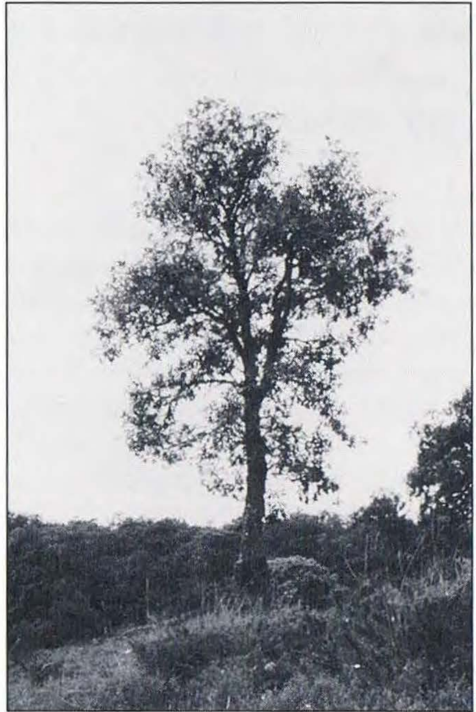
Quercus pachucana seen growing in Hidalgo, Mexico.

thick at breast height, sometimes shrub-like and branched from the base; bark grayish, dark gray or nearly black, in irregular small thick and some concave plates, typically without becoming scaly. Buds 2-3.5 mm long, somewhat acute or with the apex finely rounded; branchlets reddish brown to dark brown in the second year, 1-1.5 mm thick, densely and finely stellate-tomentulose, with some simple hairs, the tomentum persisting in the second season when at least some hairs remain scattered, some pale lenticels somewhat evident. Stipules 4-5 mm long, linear, membranous, deciduous